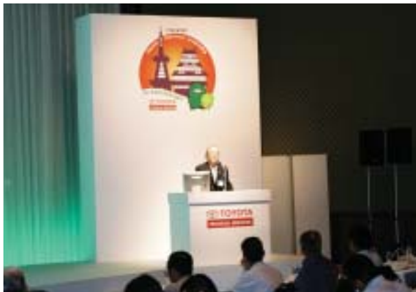
TFS World Sales Finance Conference

At present, We underwrite these products in nine countries — Germany, France, the United Kingdom, Norway, Thailand, Taiwan, Australia, New Zealand, and Hawaii in the United States. This is becoming a core business for us and our final goal is to exploit in more and more countries along with the TMC global strategy.