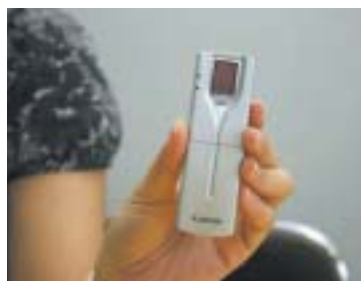
The "PUPPY" biometric identification device

Aioi Insurance regards measures in adherence with the Personal Information Protection Law to prevent the leakage of personal information as a priority management issue. With the technical support from Nomura Research Institute, Ltd., we are focusing efforts on measures to bolster the security of client PC usage, which we will steadily implement from October 2005. Aioi Insurance aims to create a highly secure PC usage environment that will feature the start-up of the non-life insurance industry's first PCs requiring biometric identification. Also, the new environment will feature the logging of PC operations and data protection based on the complete encryption of the PC hard disks. Further, we will bolster security through such initiatives as managing access authorization based on biometric identification devices incorporated into a new backbone operating system.