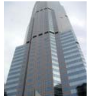
Aioi Insurance’s representative office in Shanghai