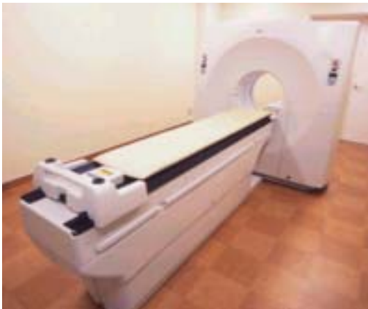
A positron emission tomography camera

PET (positron emission tomography) medical examinations are an effective way of discovering cancer. In April 2005, Aioi Insurance initiated PET Health Check Introduction Services , which introduces customers to medical facilities where they can receive PET medical examinations and helps with appointment procedures. Given that cancer is the leading cause of death among Japanese people, the early detection and treatment of cancer is an important issue. And, PET is at the forefront of diagnostic equipment for cancer. By introducing facilities with PET capabilities, our PET Health Check Introduction Services aims to ensure that customers receive early diagnoses if they have cancer. Aioi Insurance had alliances with 18 facilities offering PET examinations as of June 30, 2005. Going forward, we plan to expand our range of services that cater to the needs of customers and enable them to live healthy, worry-free lives.