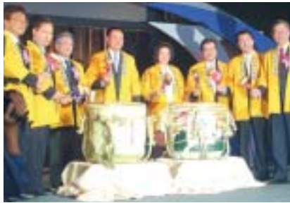
Reception of the new company

In Thailand, the strategic base of our operations in Asia, we acquired 28,500 shares, or 19%, of the outstanding stock of Wilson Insurance Co., Ltd., at a price of THB45 million (¥120 million) in October 2004. As a result, We became the largest shareholder of Wilson Insurance. And, in January 2005, we changed the corporate name to Aioi Bangkok Insurance Co., Ltd., which is concentrating operations on providing dedicated automobile insurance for Toyota vehicle owners and various commercial line products and services to Japanese corporate customers operating in Thailand.